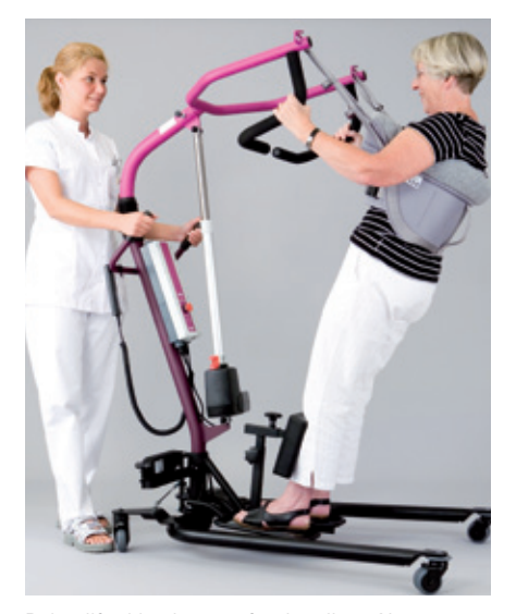
Being lifted is pleasant for the client. No pressure is experienced under the arms.