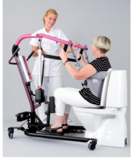
The client can gently be lowered on to the toilet.

When a change of the Patient Hoist to a Stand-Up Hoist is required, the outer part of the lifting bar is removed and the fork shaped bar + foot and knee support is attached - with no use of tools, at all. For the sake of convenience the hoist should be braked during conversion.