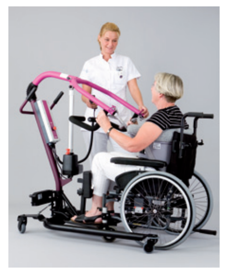
Notice: The knee support is anatomically designed - and can be adjusted both vertically and horizontally. That means you always achieve a correct adjustment of the knee support.

Effortless raising and lowering of client. Easy and comfortable transfer between wheelchairs, beds, toilet, bath, etc. Clear access to the clients clothing for toileting. Elimination of stress and strain upon the carers back. The pictures below shows how easy a client can be transferred from a wheelchair to a toilet.