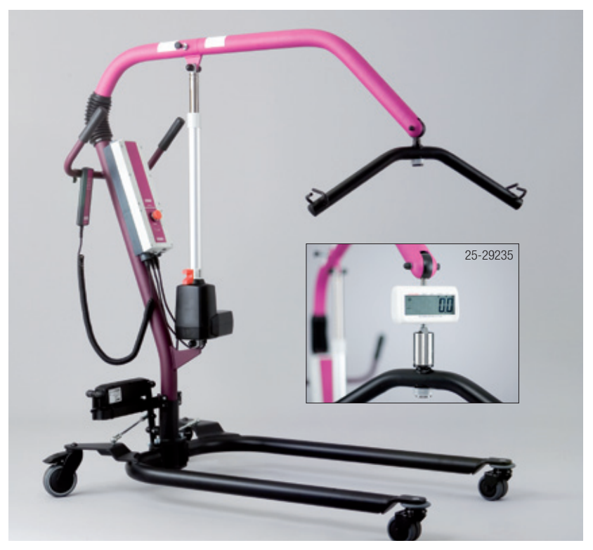
The unique "All-in-One" active Hoist can be converted from a standard Patient Sling Hoist to a Stand-Up Hoist - without using any tools. It is easy to convert the Patient Hoist to a special Stand-Up Hoist and make transfers in a standing position.