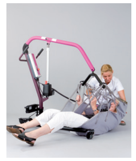
With the "All-in-One" hoist it is possible to lift a client from the floor.