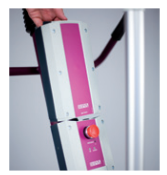
The hoist is eqiupped with both electric and manual operated emergency lowering. The battery is easily interchangeable.