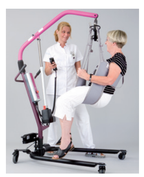
The special Domino "Hygiene" sling provides excellent access to the client, it gives good support and is easy to use.