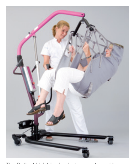
The Patient Hoist is simple to operate and has a wide lifting area - from lowest to highest position - facilitating floor to high bed lifts.