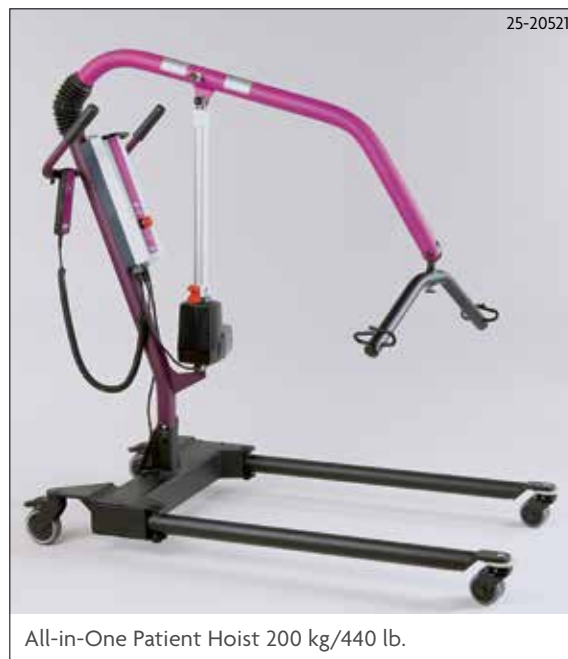
All-in-One Patient Hoist 200 kg/440 lb.