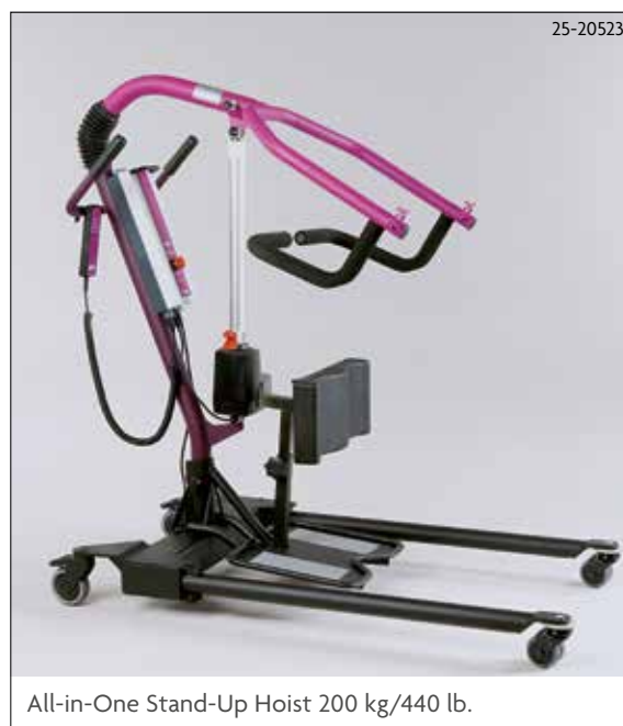
All-in-One Stand-Up Hoist 200 kg/440 lb.